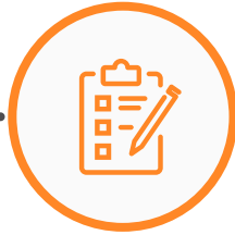
Assessment & Consulting