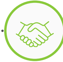
Networking & Community